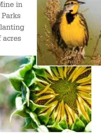
Native plants will help the eastern meadowlark and other grassland birds rebound from habitat loss.

such as grasshopper sparrows, northern bobwhites, eastern meadowlarks and dickcissels. All these species have suffered over the last 30 years due to the loss of habitat from changing land-use practices, ongoing land development and increasing woody species like junipers and oaks from the lack of wildfires.