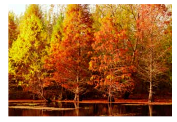
Forested wetlands are an important part of Luminant's reforestation program.