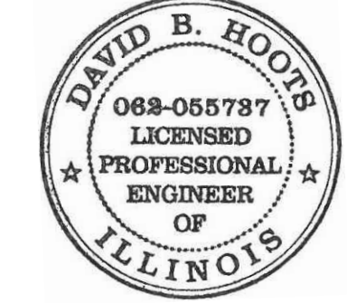
Date: 10/13/2016, LICENSE EXPIRES 11/30/2017