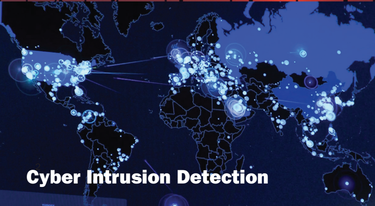
Cyber Intrusion Detection