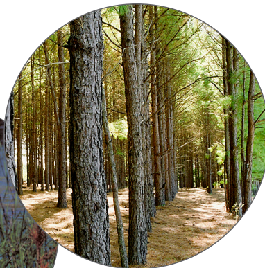
Reclaimed lands at Luminant